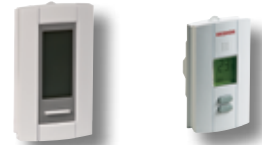
Programmable and non-programmable thermostats available with electric floor heating system, Model EFMA.