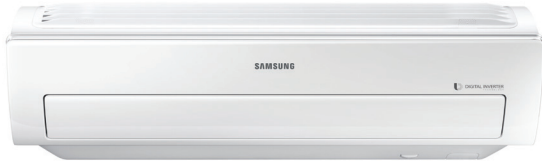
18K & 24K MODELS