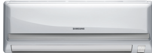
30K & 36K MODELS