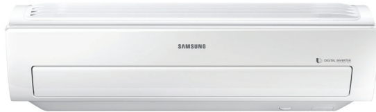
12K, 18K & 24K MODELS