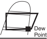
Dew Point—Saturated Vapor (psig)

Typical pH Diagram Superheat— Reference Point